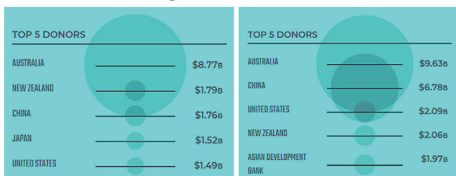
Top 5 Donors of Aid Spent (left) and Committed (right) in the Pacific 2010-2018

Source: The Lowy Institute, Pacific Aid Map N.B. Data for 2019 and 2020 has not been reported for all donors and is incomplete. 2018 is the latest year of comprehensive aid data from all donors.