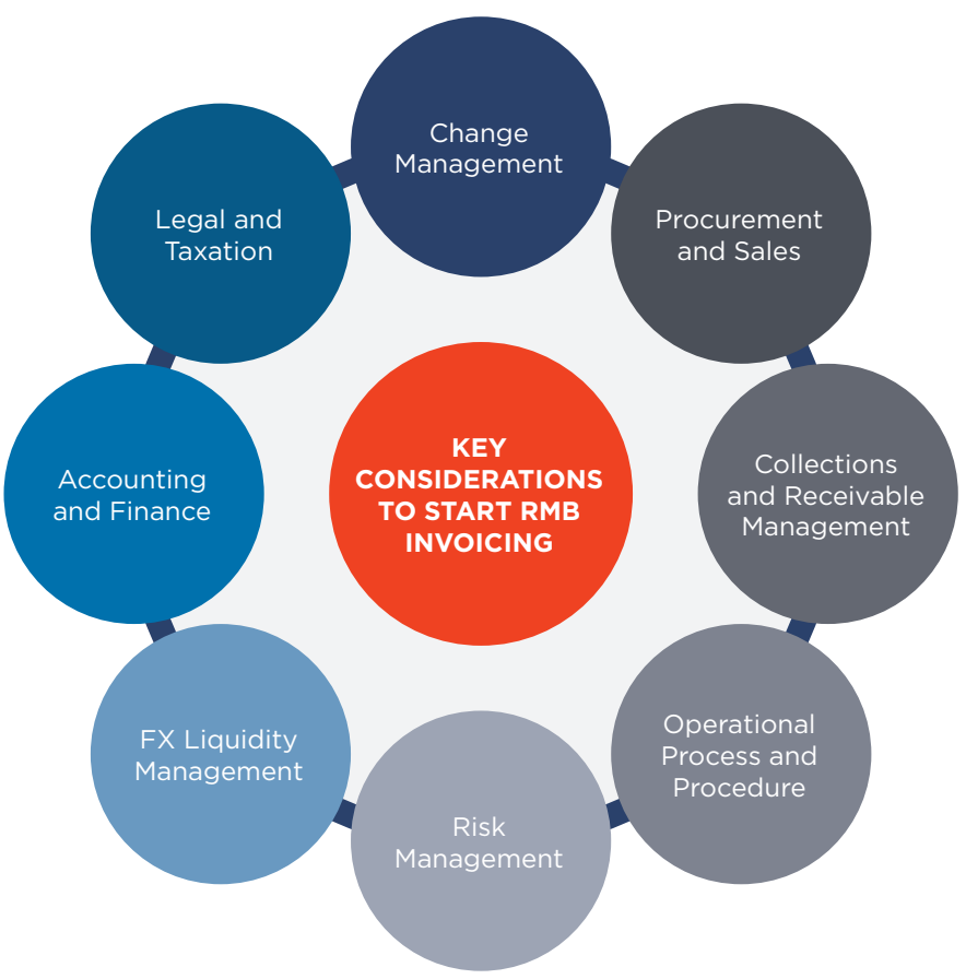
FIGURE 2: KEY CONSIDERATIONS FOR RMB INVOICING